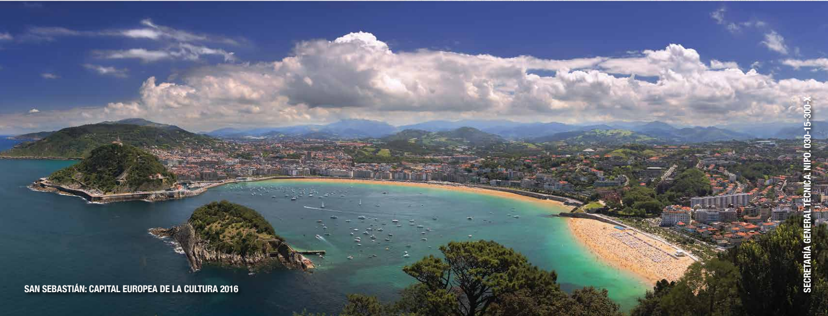
SAN SEBASTIÁN: CAPITAL EUROPEA DE LA CULTURA 2016

SECRETARÍA GENERAL TÉCNICA. NIPD. 030-15-300-X