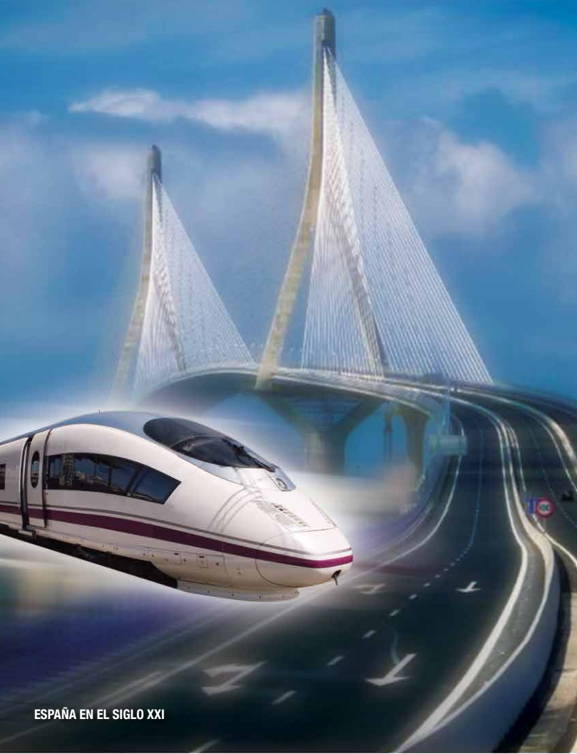
ESPAÑA EN EL SIGLO XXI