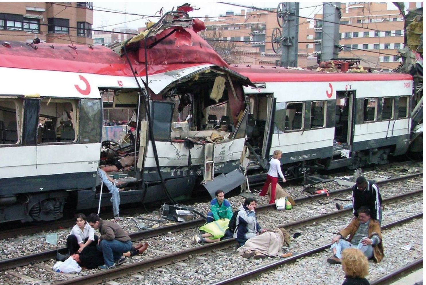
Victims of the 11-M terrorist attack in 2004 receiving assistance.