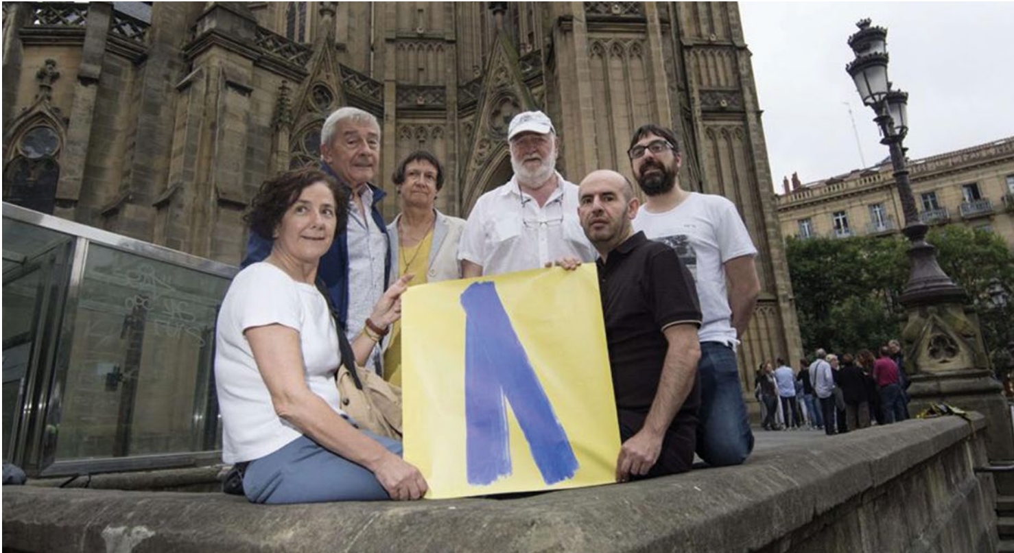
Image of the news report "El secuestro que desató el lazo azul" (the kidnapping that spark the blue ribbon).