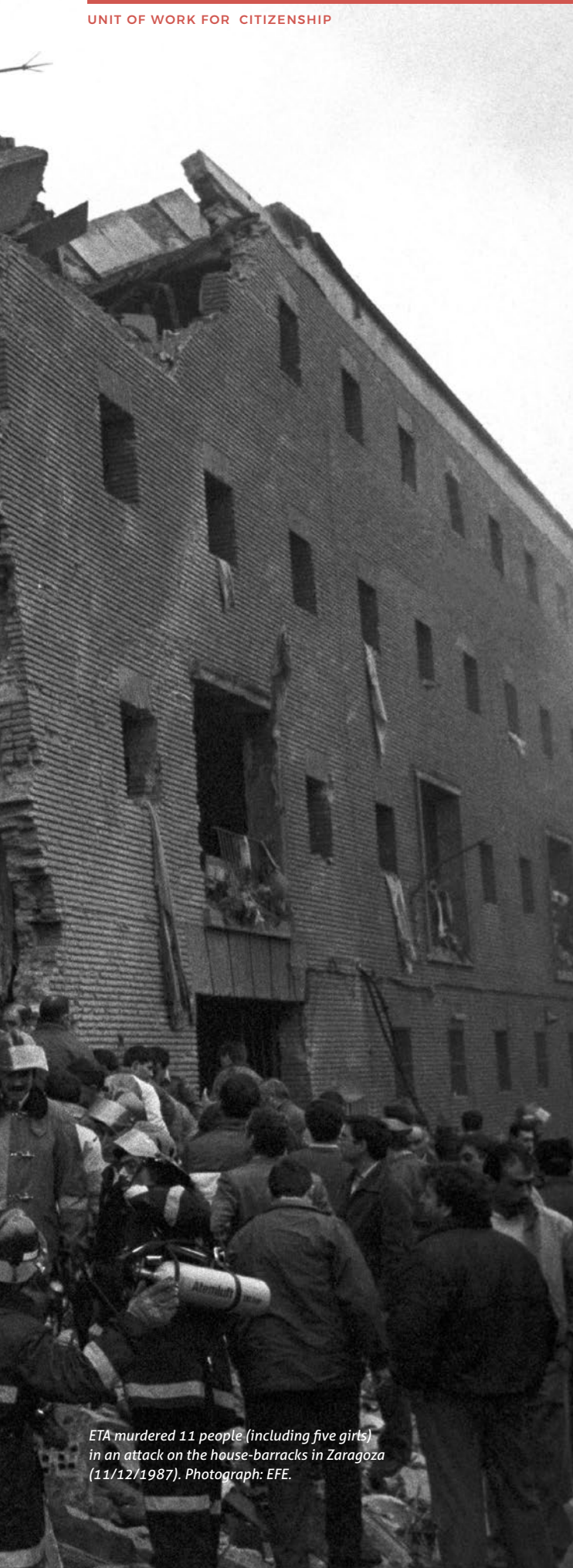
ETA murdered 11 people (including five girls) in an attack on the house-barracks in Zaragoza (11/12/1987).