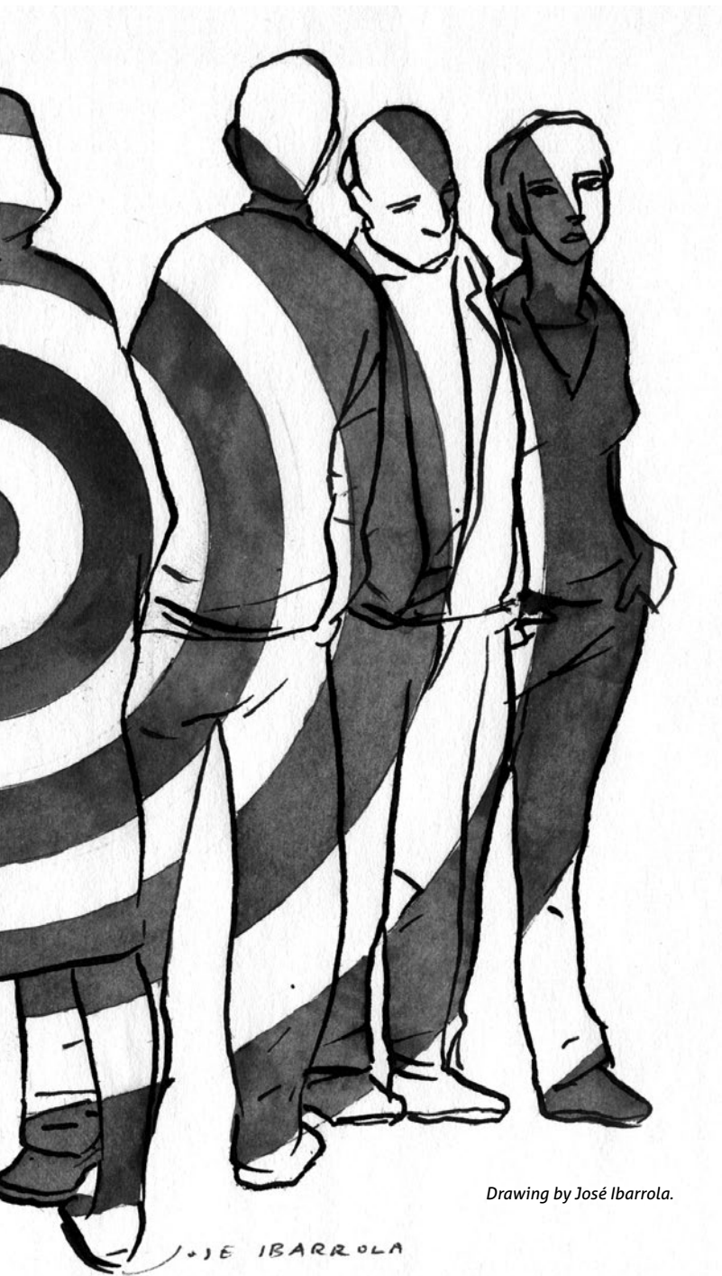
Drawing by José Ibarrola.

The knowledge acquired from these activities, the analysis of your own emotions and feelings, engaging in reflections on what we do for victims of human rights violations (specifically victims of terrorism), as well as the importance of memory, justice, truth and recovery, are all very important areas covered in this unit.