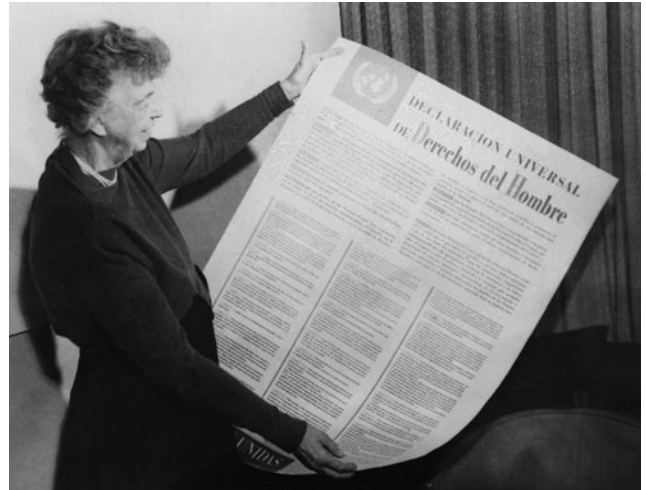
Eleanor Roosevelt holding the Universal Declaration of Human Rights (UDHR) in Spanish. November 1949.