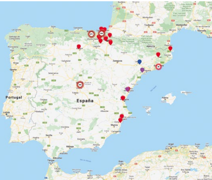
Map of Terror.

Unfortunately, this violation of human rights occurs in much of the world and also very close to you. Here is a shocking fact: in Spain alone, almost 1,500 people have lost their lives from terrorist attacks since 1960.